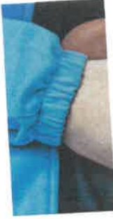
Elasticated cuff detail